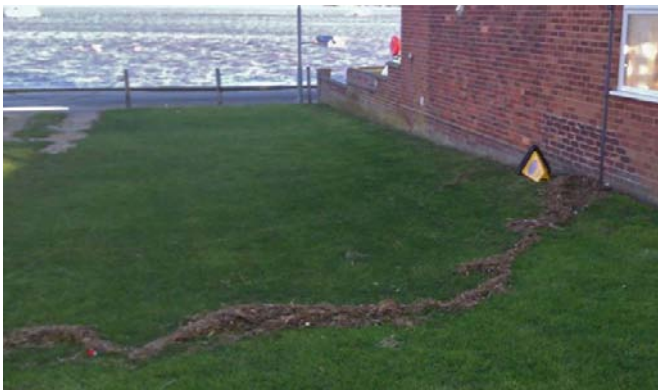
The tide line!