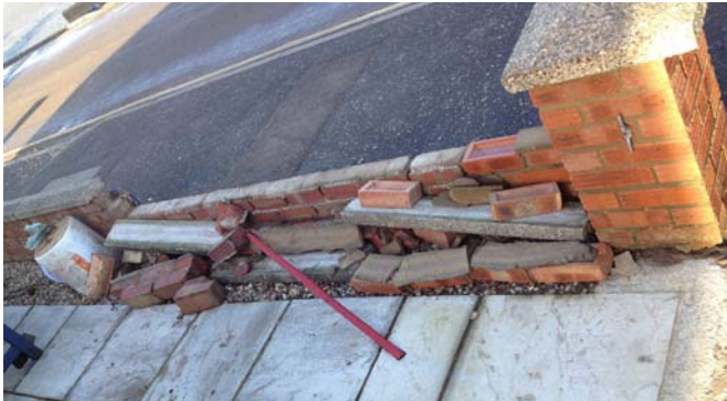
Flood damage to our wall.

We were pleased to see that there was very little damage to the clubhouse, which was fortunately built high enough to avoid the water coming into the sailing club. The front wall was damaged, a part of it being knocked over.