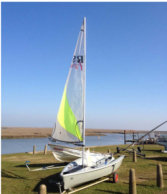
One of the Club Fevas, ready to be taken on the water.