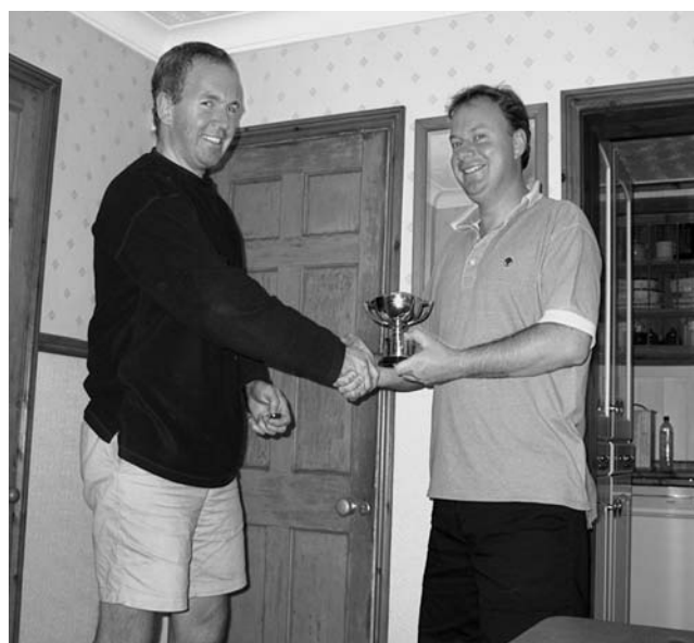
In September the Fairfax cup was finally handed over, at an impromptu prizegiving, to last year's rightful winner (it's moving from left to right!).

If you have the desire, we have the facility!