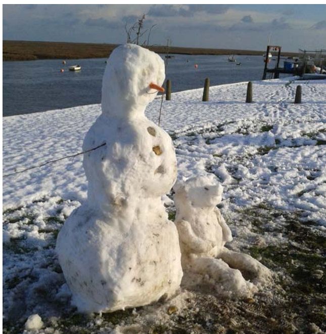
Winter sailing was somewhat affected by the weather. What heroes! These two sailors are heading for the showers

Any items to be included in AOB should reach the Secretary (in writing) at least one week prior to the meeting.