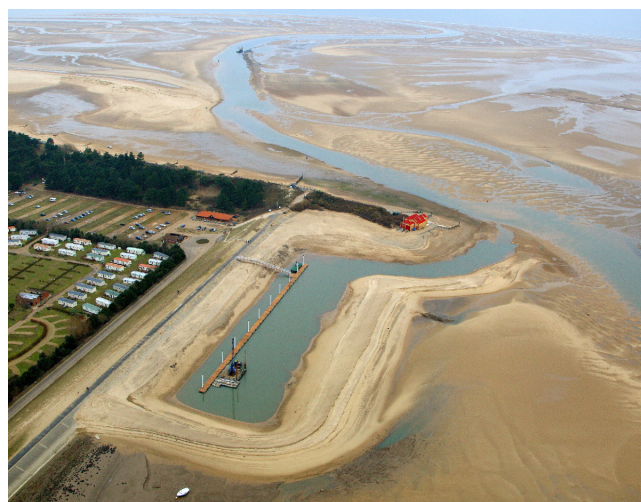
The harbour mid-February 2010

2010 is a busy year on the water. Sharpies may travel to Burnham Overy (May 1–2), Brancaster Staithe (May 22–23), British Championships at Brancaster