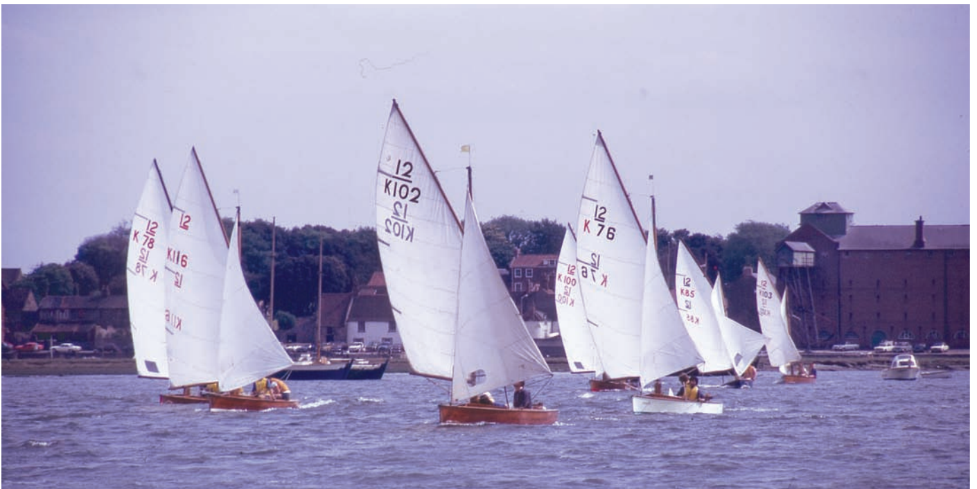
A wonderful shot of Sharpies, this could be after a running start from town line.. two laps course 1!