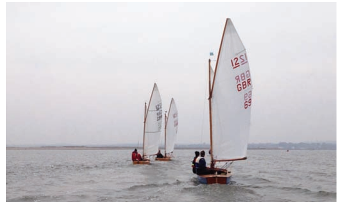
Racing home with the sailing club in the far distance.