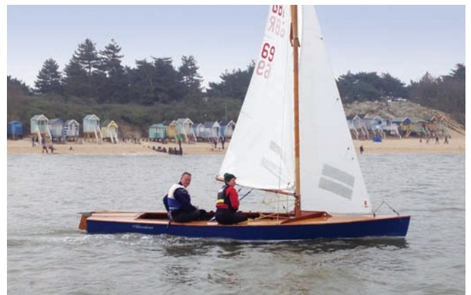
Sights from the committee boat: Sharpie Adventure and a lovely view of the Beach huts, so distinctive of Wells.