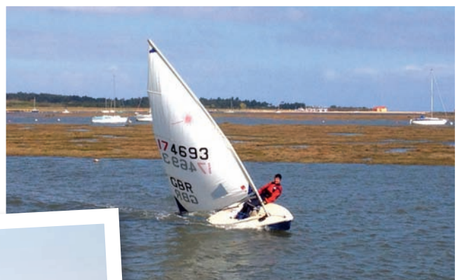
Above: first sail of the season XXX takes his laser for a spin.

Since the last edition of Half Hitch , we have 'fitted out' at a very enjoyable Fitting Out supper and ventured out onto the water, on what turned out to be a lovely spring day and a perfect way to start the sailing season. We have exciting events lined up, particularly over the Early May Bank Holiday weekend when we will be having a New Members' Lunch and on the following day our inaugural 'Get Afloat Day'.