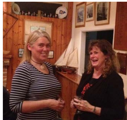
The fitting out supper – members young and long-standing enjoying the fare.

The low cost of the lunch is just to cover the ingredients, and children eat free!