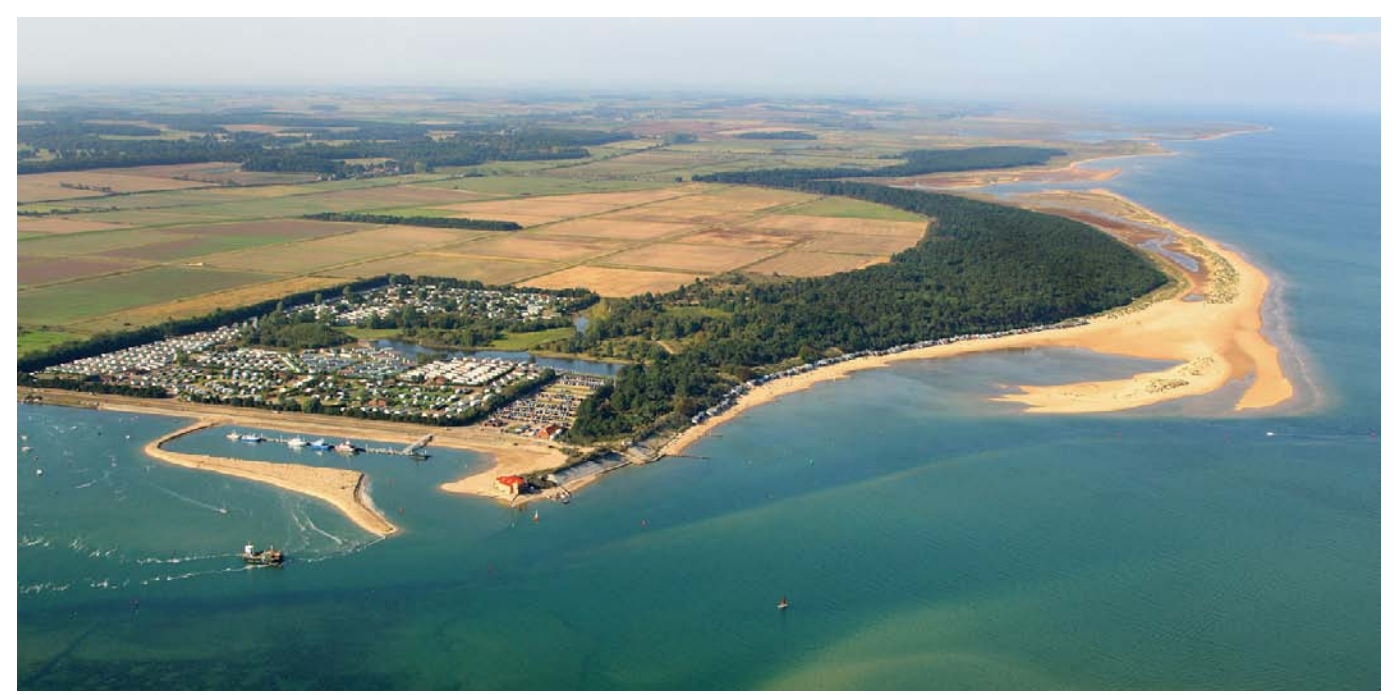
A recent photo of the harbour mouth. Despite it being quite a good tide the shallow areas are clearly shown as is the dark line of the channel.