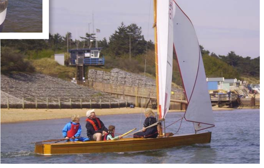
Pool buoy beach was the centre of operations, with rides available in everything from Sharpies to the club's fast RIB Herbert E.